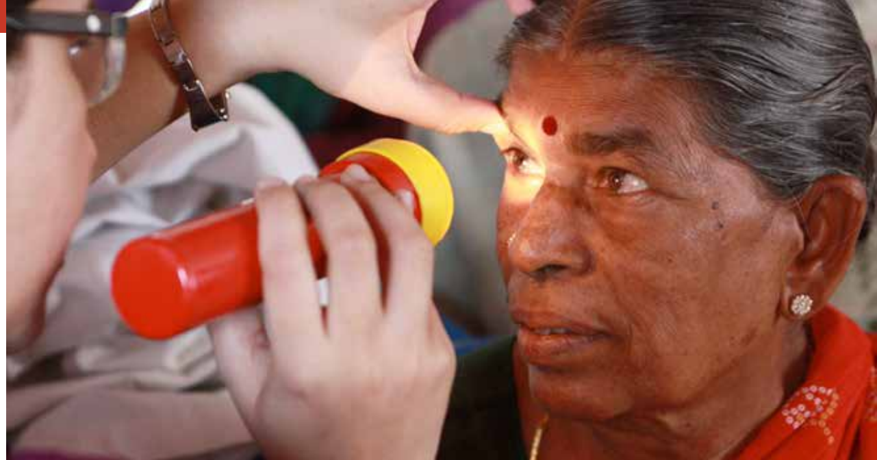
Right: A woman has her eyes examined.