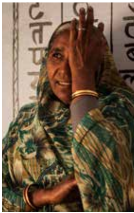
Above: A woman has a vision test to determine her visual acuity.